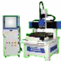
CNC Engraving & Milling Machine