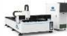
Fiber Laser Cutting Machine