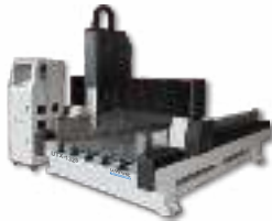
CNC Stone Engraving Machine