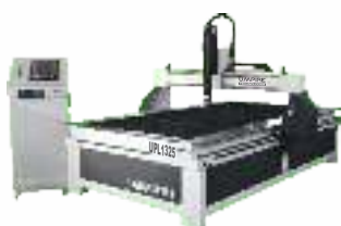
CNC Plasma Cutting Machine