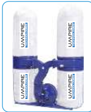
Dust Collecting System